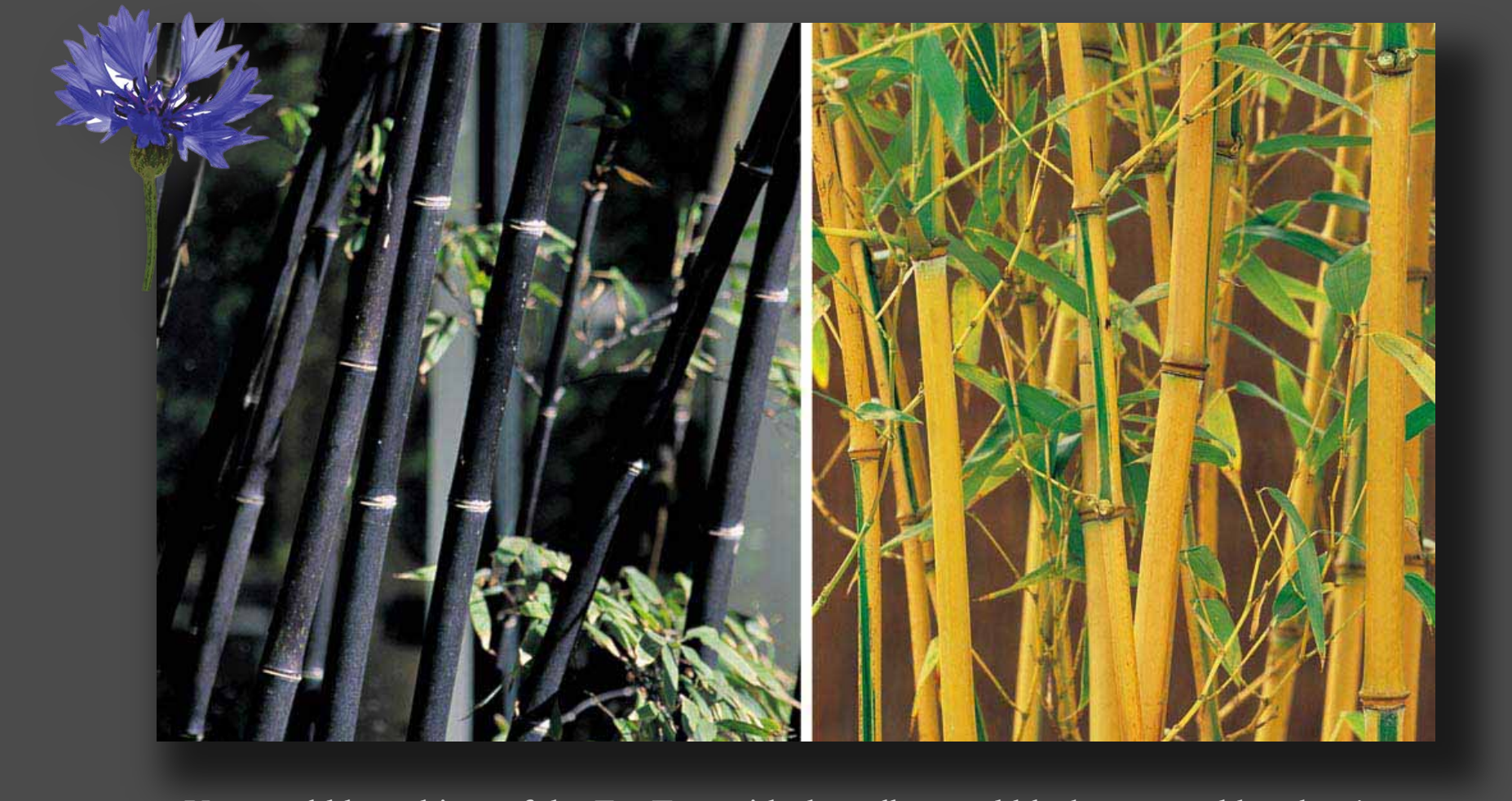
You could have hints of the Far East with the yellow and black stemmed bamboo! ( Phyllostachys nigra & aurea ). Planting close to your deck could offer a bit more privacy