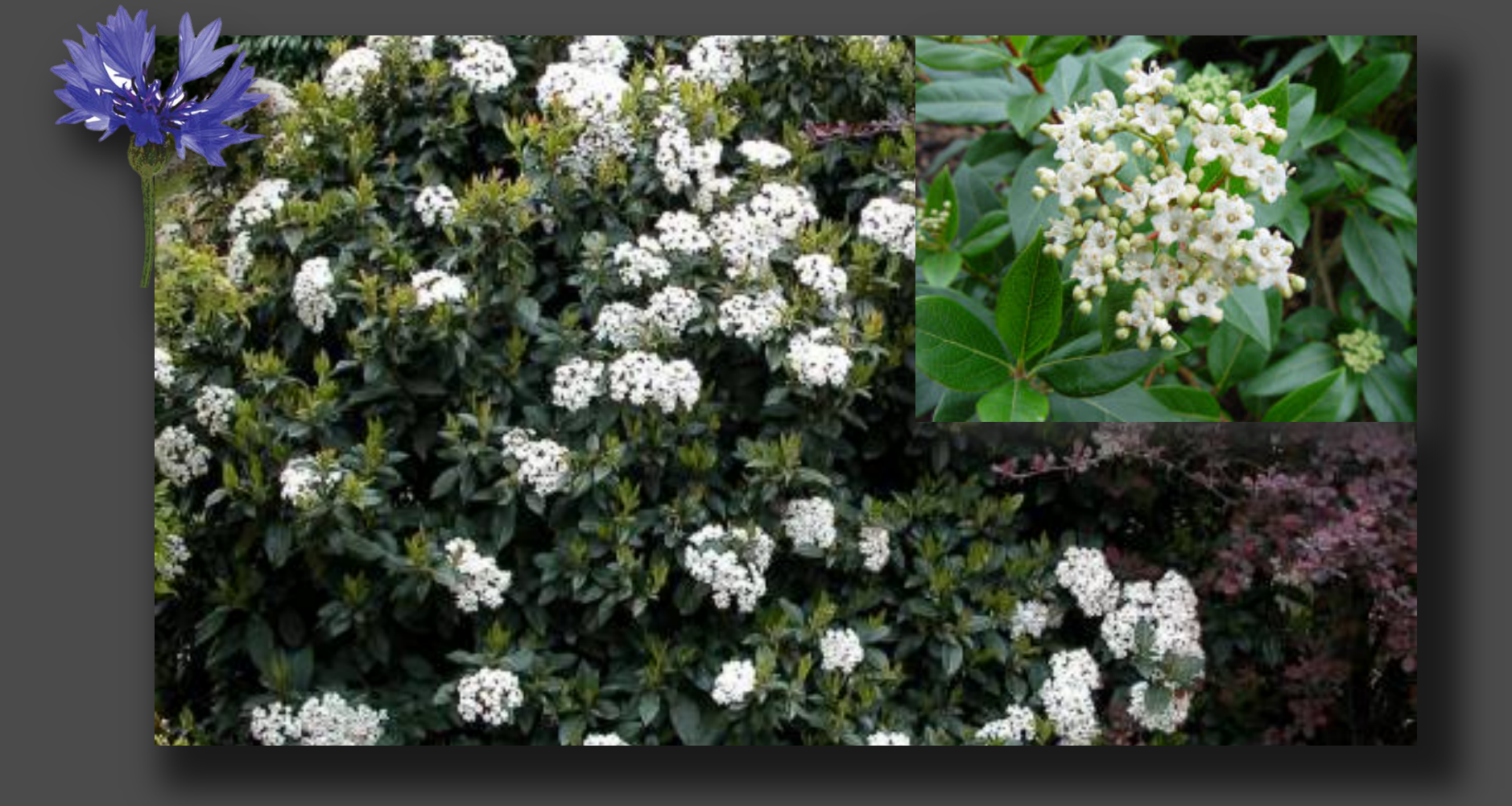
Viburnum tinus 'French white' – reliable evergreen, scented, flowers Feb-March.