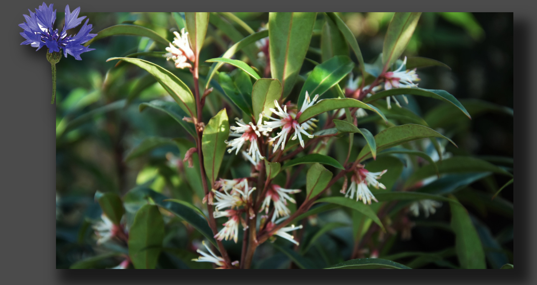
Sarcococca hookeriana Dygna (Sweet Box)— evergreen, scented, flowers Dec-March. Wonderful shrub with a rare Christmas time scent! Good to plant close to your doors.