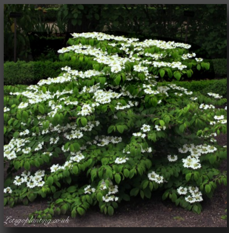
Camellia 'Williamsii', Viburnum plicatum 'mariesi'. Both offering up early Spring colour